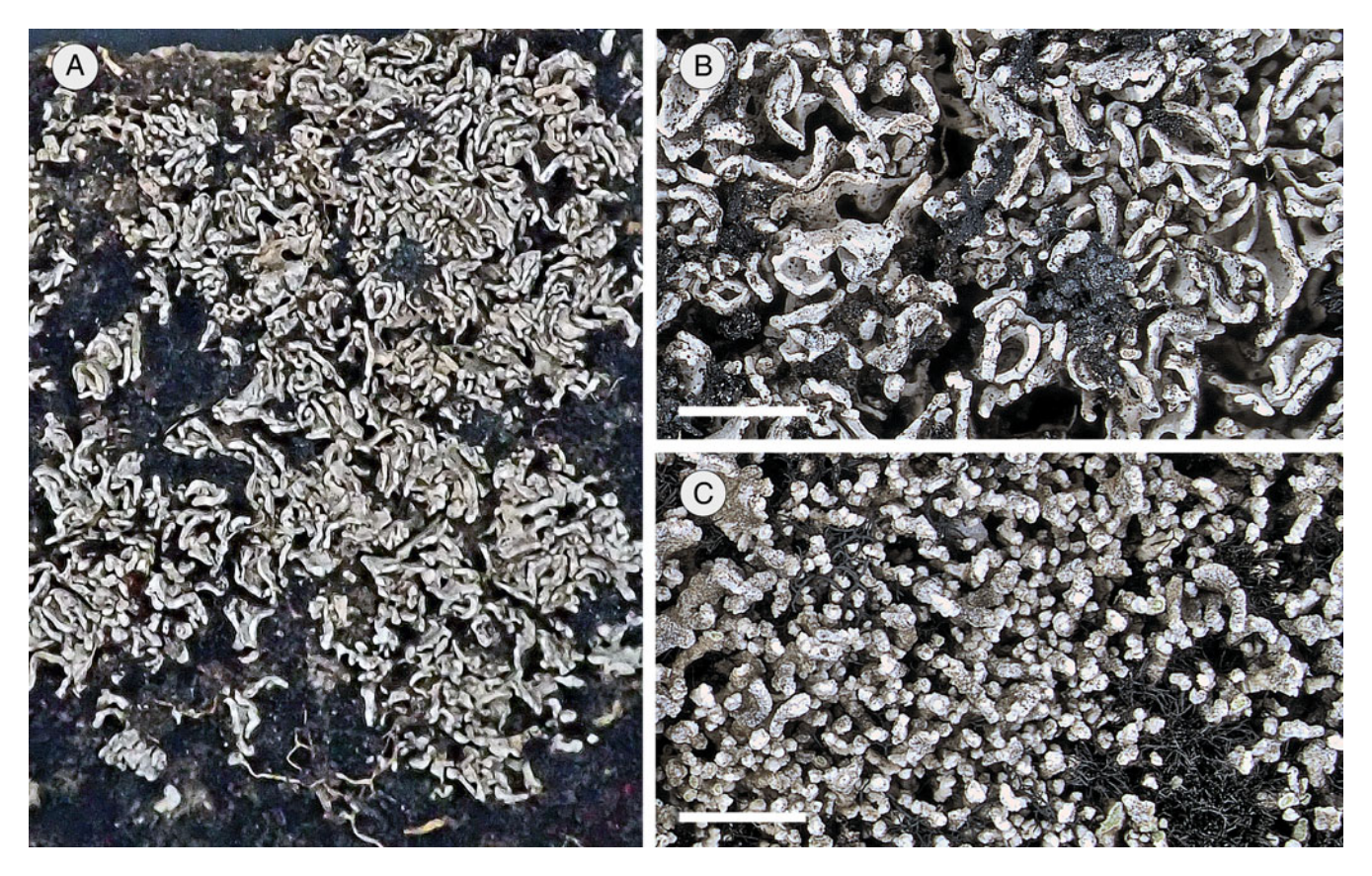
Fig. 1. Parasiphula squamosa habit. A, typical form with flattened, squamulose lobes (Kantvilas 12/97A). B, squamulose thallus detail (Kantvilas 12/97A). C, form with the ultimate segments of the squamules becoming terete (Kantvilas135/18). Scales = 2 mm. In colour online.