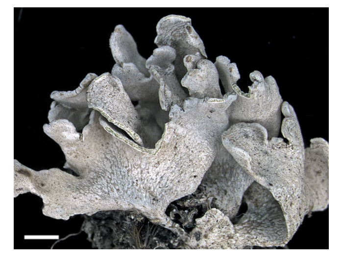
Fig. 2. Siphula capensis habit. Note the thickened apices (holotype). Scale = 2 mm. Image: J. Jarman. In colour online.

Thallus foliose when well developed, more rarely sqamulose, forming a tight cushion or mat to c. 80 mm wide and up to 20 mm thick, in section delimited by a cortex 25-50 µm thick composed of densely packed, short hyphae 1.5-2.5 µm thick. Photobiont a unicellular green alga with globose cells 5-10 µm diam., occurring as an interrupted layer 50-65 µm thick or, more commonly, dispersed throughout the entire medulla. Lobes rather robust, plane, convoluted, sparingly branched, densely congested, erect or ascending, 2.5-8 mm wide, up to c. 5-15 mm tall, 0.3-0.5 mm thick; surface pale greyish or whitish, sometimes with a faint pale bluish hue, smooth or somewhat dimpled and puckered, sometimes a little scabrid; apices entire, typically a little revolute and therefore appearing rounded and somewhat thickened. Rhizines firmly buried within the substratum, pale beige to grey, terete, branched, c. 0.5-1 mm thick at point of attachment to the lobes.