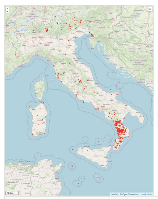
Figure 1. doi Distribution map of CLU Herbarium specimens in Italy. Map created with Leafletjs (Agafonkin 2023).

are provided in tabular format (Suppl. material 1) and as a Krona graph (Suppl. material 2, Ondov et al. 2011).