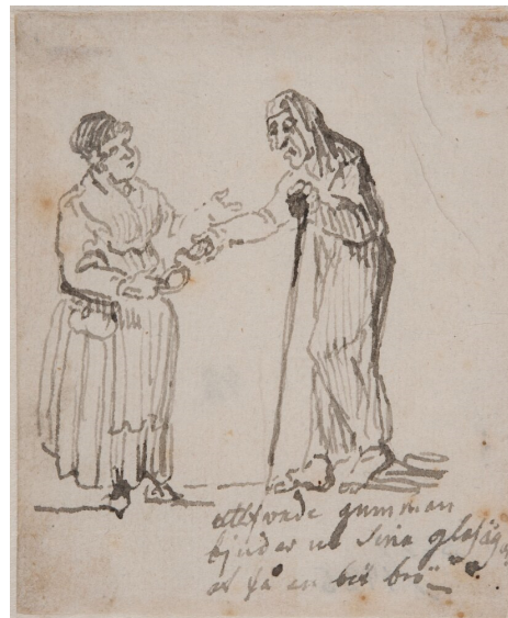
Figure 3. Poor old woman trying to trade her glasses for a piece of bread. Eighteenth-century wash drawing by Elias Martin.