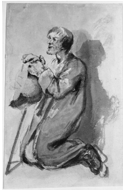
Figure 2. Images of poor and starving people are uncommon from the eighteenth century, but there are a few exceptions, such as the wash drawings by the artist Elias Martin. Old man begging (Courtesy of National Museum of Fine Arts, Stockholm).