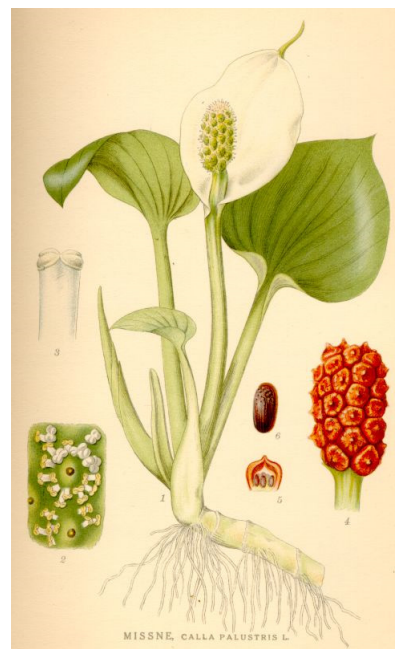
Figure 4. Ground starchy rhizomes of bog arum, Calla palustris , were regularly used for bread by the peasantry in northern Sweden in the eighteenth century. During grain shortages, their use increased (Illustration by J.W. Palmstruch, Svensk botanik , 1815).

Some of these species were used locally, while others were used as emergency food in large parts of Sweden. Sources: [16,29,31,32,39,40,42,43,47].